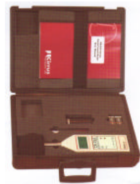
Typical Measurement Kit

If the Sound Level Meter has been upgraded to the +Version , the measurement kit will also include an RS232 Cable to connect to a PC and the Deaf Defier software and upgrade code.